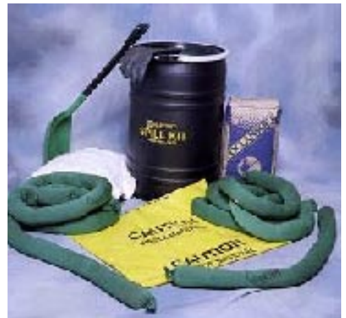
Order #: OSK121