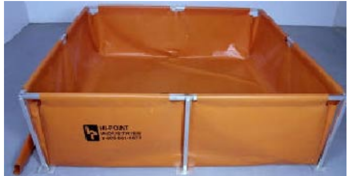
FRAMED TANK Order #: FMT1000