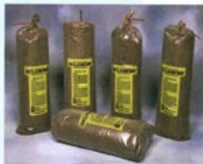
Oclansorb®: Five 10-liter Tubes (Loose) Order #: OC510