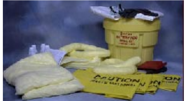
Order #: BSK16