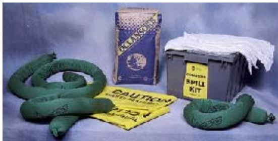
Order #: OSK58

Approximate size: 12" * 20" * 16" Absorption capacity: 58 liters ( 15 U.S. gallons )