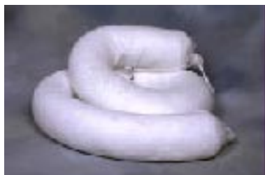
Order #: PAB02

Use Hi-Point Polypropylene Absorbent Boom to soak up hydrocarbon spills on land or on water.