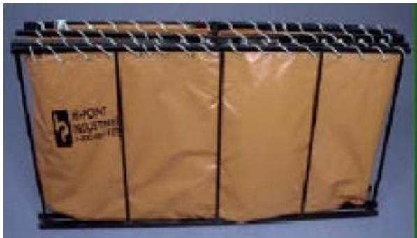
FLEX TANK Order #: FXT1000