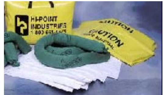
Order #: OSK64