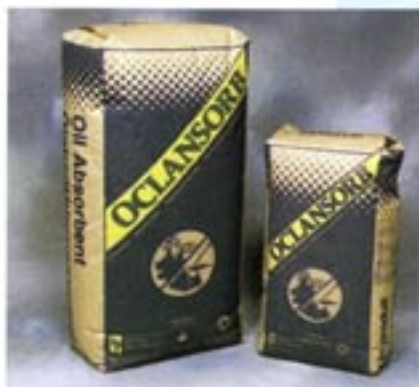
Oclansorb® 13-liter bag (Compacted) Order #: OC13 Oclansorb® 44-liter bag (Compacted) Order #: OC44