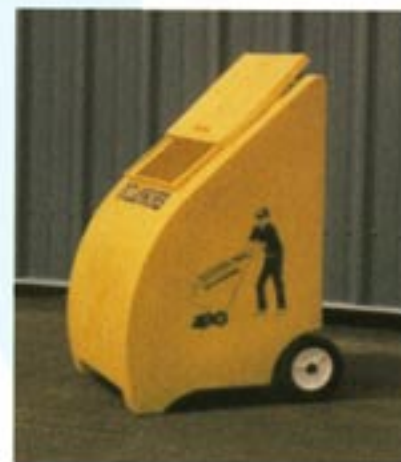
Oclansorb® Spreader Order #: OS88