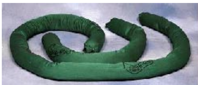
Sorb Sox® 4" * 2' Miniboom Order #: SS42 Sorb Sox® 4" * 4' Miniboom Order #: SS44 Sorb Sox® 4" * 8' Miniboom Order #: SS48