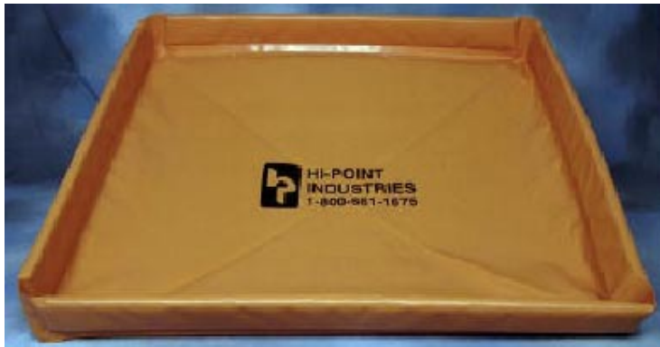
Hydrocarbon Berm Order #: BRM44