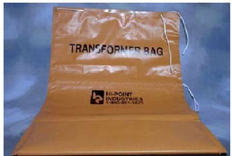
Order #: TB02

With the use of RF heat-sealing technology, Hi-Point Industries can ensure that all containment bags are leak proof.