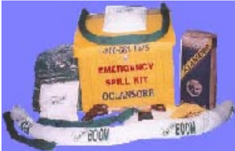
Order #: OSK302

Approximate size: 42" * 30" * 29" Absorption capacity: 302 liters ( 80 U.S. gallons )