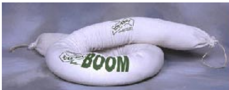
Sorb Sox® Boom 7' * 10' Order #: SB710

Light, compact and easy to maneuver, Sorb Sox® Miniboom and Sorb Sox® Boom are oil absorbent socks fill with Oclansorb®. Easily molded to fit the shape of any oil spill, their strong wicking action draws and retains oil on contact, leaving a clean and dry surface. Once the oil is absorbed, they can be easily disposed in landfills or incinerators, local regulations permitting. Sorb Sox® Boom perform equally as well as Sorb Sox® Miniboom, but are used for much larger spills.