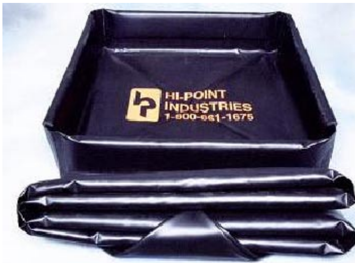
Chemical Resistant Berm Order #: CRB44

Compact and easy to use, Hi-Point Berms are made using industrial strength fabrics. Flexible foam walls permit Hi-Point Berms to be selfsupporting and frameless.