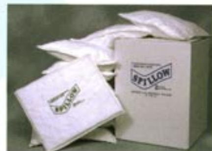
Spillow® (10 per case) Order #: SP10 Spillow® (20 per case) Order #: SP20