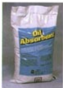
Oclansorb®: 10-liter bag (Loose) Order #: OC610