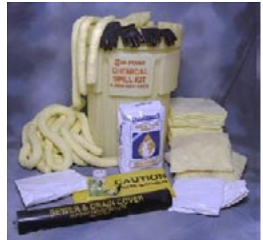
Order #: BSK285

PLEASE NOTE: ALL OUR SPILL KITS MAY BE CUSTOMIZED TO MEET YOUR NEEDS.